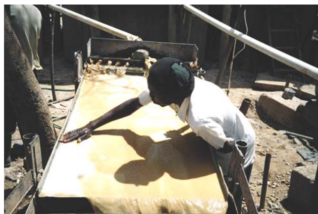
Bare-handed miner in Zimbabwe exposing himself to cyanide and mercury

The training modules will be supported with videos, slides, posters, brochures, etc.