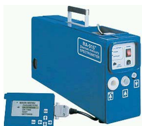
LUMEX allows accurate Hg analyses in the field

The PCU has selected LUMEX RA 915+, a CVAA spectrometer, to complement existing analytical equipment of selected laboratories in the 6 GMP countries. This instrument was devised for air analysis, but it is also suitable for analyzing Hg up to 0.5ppt (ng/L) in solution. Another kit, a