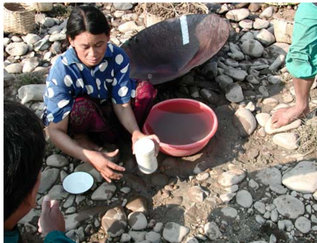
Female miner in Lao PDR using mercury to amalgamate concentrate from panning

From February 1 to 5, the PCU met with the Sudanese, Tanzanian and Zimbabwean project representatives in Zimbabwe to discuss the implementation strategy in Africa. The visit of the Sudanese and Tanzanian representatives to the artisanal mining processing centers in Kadoma, Zimbabwe, was very fruitful to highlight points for discussions on the advantages and drawbacks of the different types of equipment being used by the Zimbabwean miners for gold processing. Other Government representatives were in Kadoma when the PCU made a presentation of the concept of the Transportable Demonstration Units. After reviewing the document detailing all aspects of the initiative, the stakeholder gave their approval to the PCU to start the implementation process in Zimbabwe. The other two members of the African countries also welcomed the idea. A visit to a local equipment manufacturer has demonstrated the viability of implementing such idea in short term.