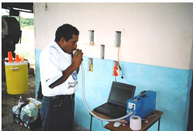
Gold miner checking the content of Hg in exhaled air.

For further information contact the Project Coordination Unit: